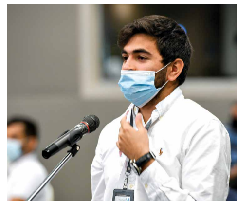
During the townhall attendees had the opportunity to ask a number of questions on a varied range of issues.

"When people ask me, 'What keeps me up at night?' they expect me to say something related to business. But