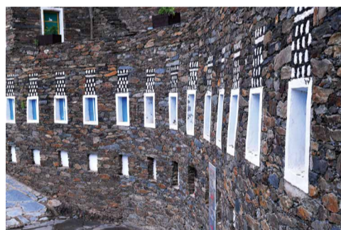
White quartz accents.