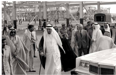
Berri Gas Plant, inaugurated in 1977 by King Khalid bin Abdulaziz Al Saud, was the first Master Gas System facility.

A circular carbon economy adds a focus on 'removing carbon' to the core circular elements of 'reduce, reuse and recycle.'