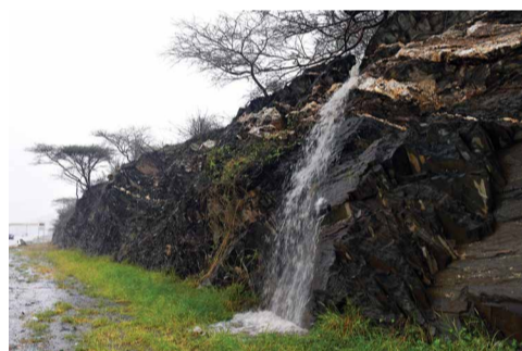
Rain turns into waterfalls.

If the hand-cut local stones of the white quartz-accented walls could speak, they would tell ancient tales of bravery, cultural and commercial exchange with the wider world, and honey.