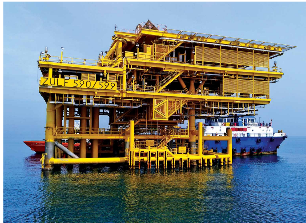
Design facilitates the circular economy and Aramco has a standard offshore wellhead design that can be used again and again without replication of engineering.

HRH Prince Mohammed bin Salman Al-Saud launched the Green Saudi Initiative, and Green Middle East initiative this year, noting that, as one of the leading global oil producers, the Kingdom fully showcases its aim in advancing the fight against the climate crisis.