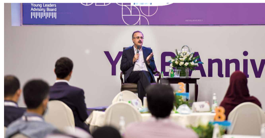
Amin Nasser talks to young employees at the recent CEO YLAB Town Hall.

cles – but these obstacles will make you stronger," Nasser said. Leaders who trust in the talent of their team members and who draw upon an inner resilience are leaders who can have the most impact, he added.