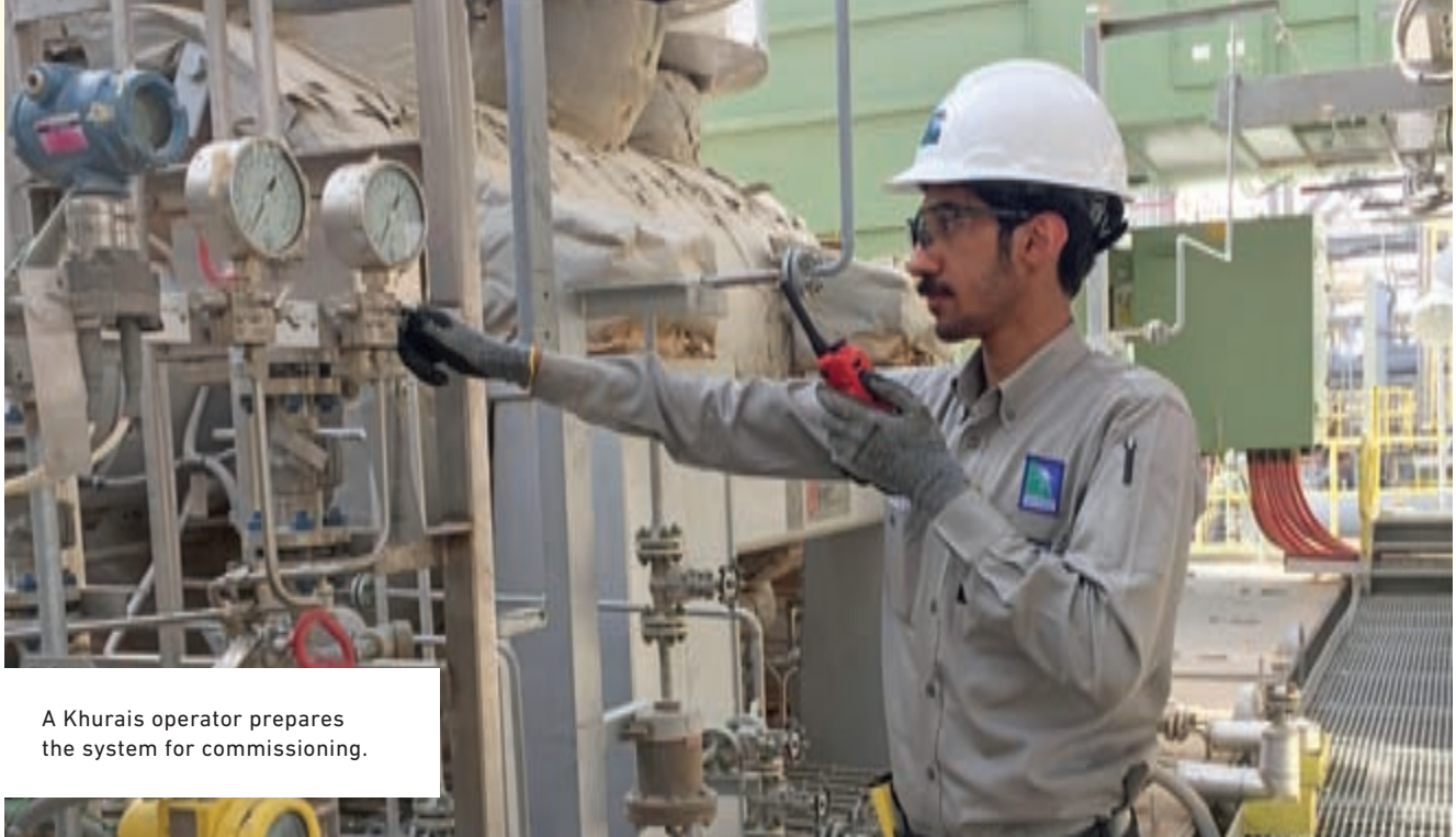
A Khurais operator prepares the system for commissioning.