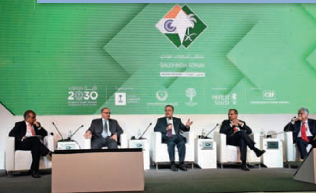
Amin Nasser, president and CEO of Saudi Aramco, speaking on "Future Forward Sectors" during the Saudi-India Forum.

The event focused on promoting the D&WO industrial work environment, enriching students' knowledge, and building interest in the energy industry — specifically D&WO operations. 🌐