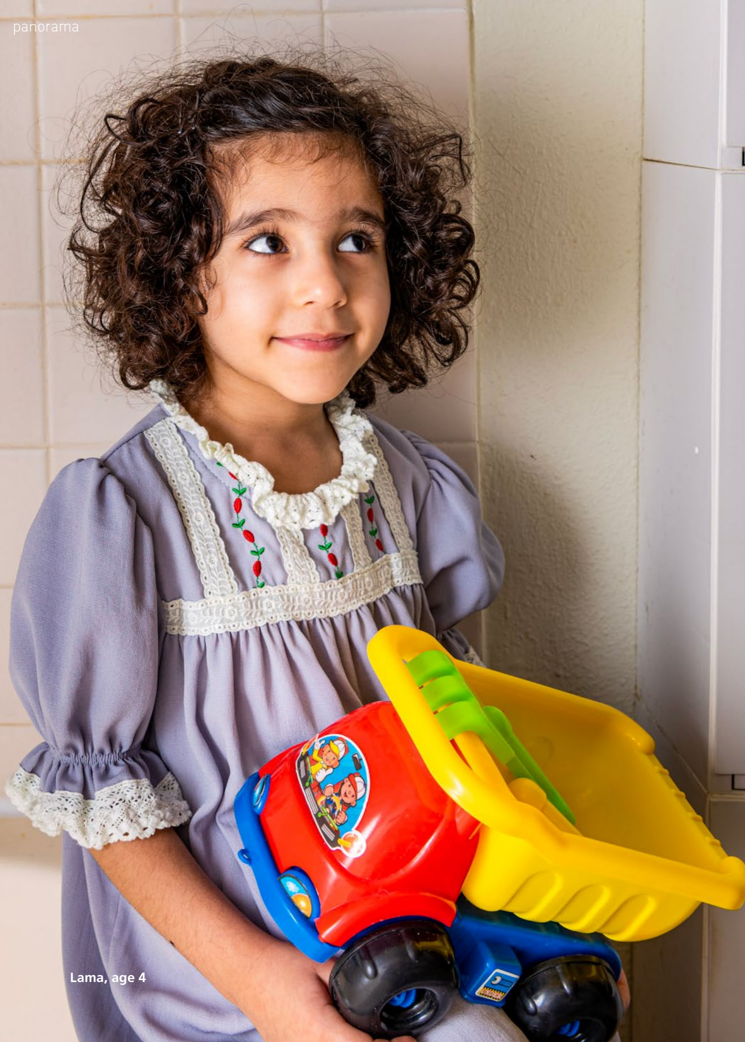
Lama, age 4